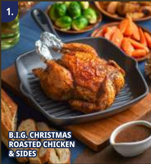
B.I.G. CHRISTMAS ROASTED CHICKEN & SIDES