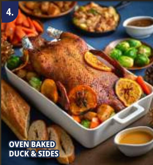
OVEN BAKED DUCK & SIDES