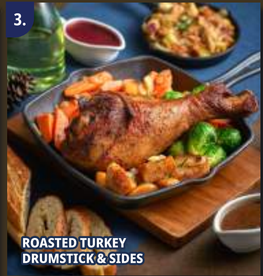
ROASTED TURKEY DRUMSTICK & SIDES