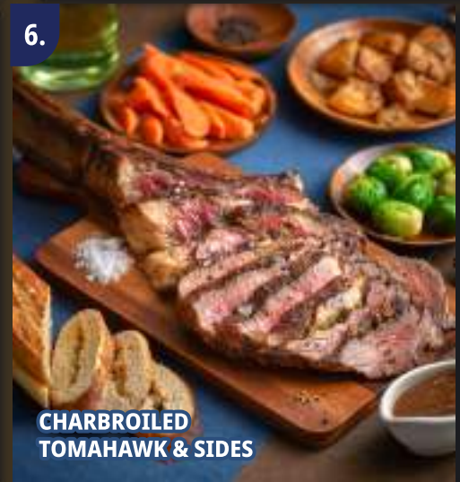
CHARBROILED TOMAHAWK & SIDES