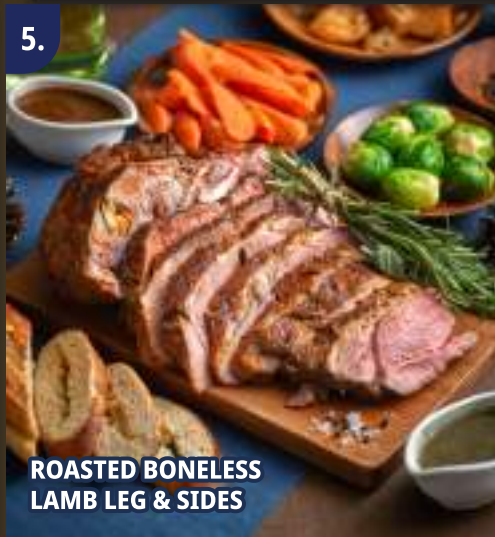
ROASTED BONELESS LAMB LEG & SIDES