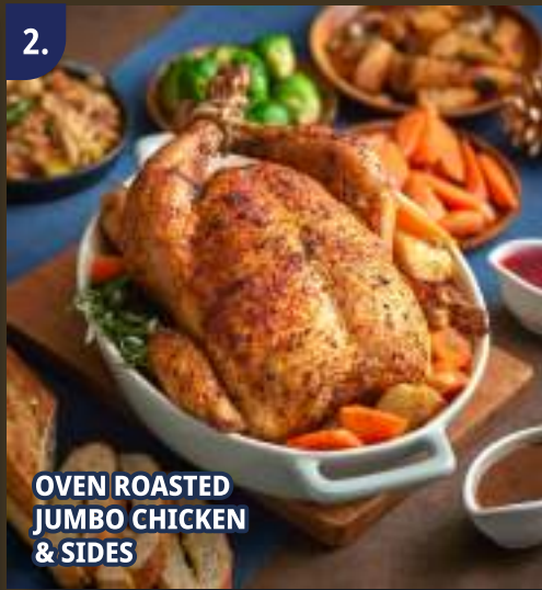
OVEN ROASTED JUMBO CHICKEN & SIDES